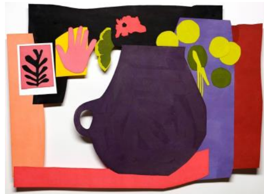
Say Hello, Wave Goodbye by Nancy Gruskin

Time is running out to sign up for the paper collage workshop on May 18, 1:00–3:00 p.m., with Nancy Gruskin . Simple materials and basic shapes will be the ingredients for building a unique scene. Participants will provide their own materials: scissors, glue, materials to collage with, and a substrate (backing material) onto which to glue the pieces. The workshop is free to everyone—BACS members and nonmembers alike—and will be presented via Zoom.