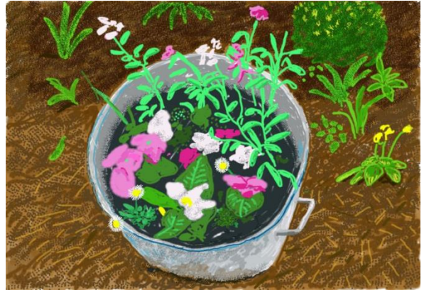
Art by David Hockney

https://www.bbc.com/news/entertainment-arts-52109901