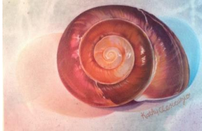
Colored pencil drawing by Kathy Clericuzio