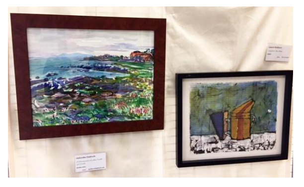
From a previous Throckmorton show

https://www.bedfordma.gov/council-onaging/pages/calendarnewsletters.