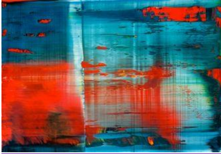
Abstraktes Bild (Abstract Painting), 1999, oil, by Gerhard Richter