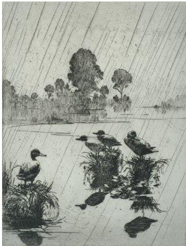
Ducks in the Rain, 1918, etching by Frank Weston Benson

Duck the April showers and watch for the May flowers! See you next month!