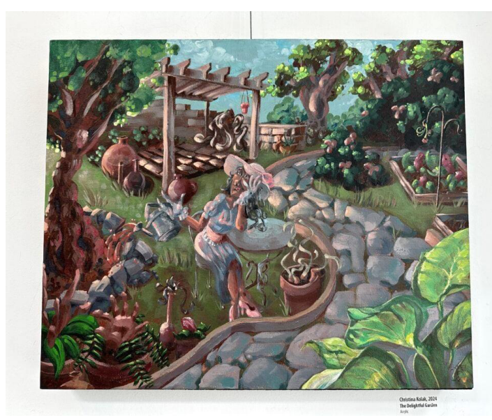
Bedford Free Public Library through September 7

The Bedford Free Public Library is currently hosting "Gen Z Creativity," a summer show featuring artwork by students at Bedford High School. The exhibit, which will run through September 7, includes 13 pieces in various mediums, among them photography, acrylic painting, digital art, ceramics, and charcoal drawing. Bedford Free Public Library, 7 Mudge Way, Bedford, MA; www.bedfordlibrary.net