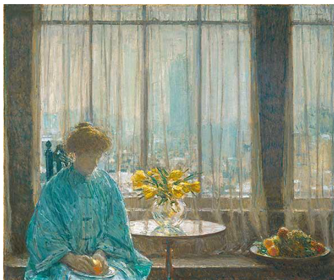
Childe Hassam, The Breakfast Room, Winter Morning , New York, 1911, oil on canvas, from “Frontiers of Impressionism”

https://www.worcesterart.org/exhibitions/frontiers-of-impressionism/