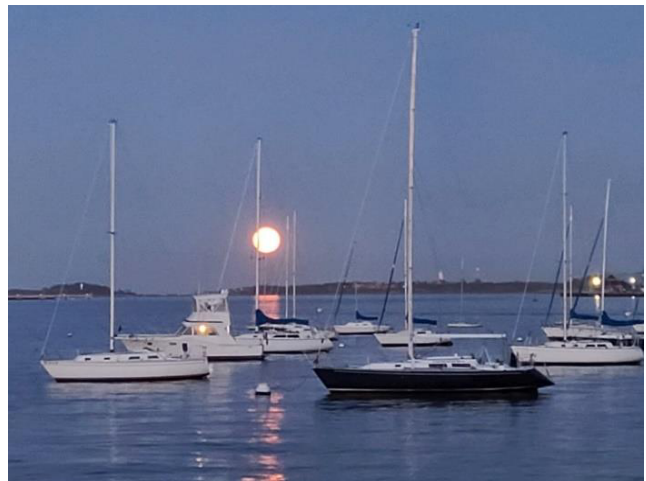
May Moonrise; photo by Sylvia Mallory