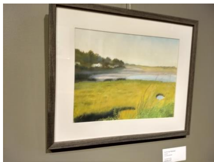
Summer Breeze, pastel by Victoria Roark

summer show, “Untitled,” at the Grace Chapel Art Gallery , 59 Worthen Road, Lexington. The exhibit may be viewed on Sundays during services and when the building is open.