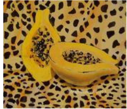
Camouflage, gouache resist painting by Nan Rumpf

include watercolor painting with Nan Rumpf , Valeria Lanza's art workshop, alcohol ink painting on tile with Gwen Chasan , and Chinese brush painting taught by Son Mey Chiu . You can also choose from courses in stained glass, photography, and more. For the brochure, go to bedfordma.gov/sites/bedfordma/files/uploads/fall_2018_brochure_2.pdf