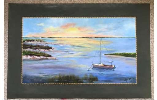
Floor cloth by Alyce McLaughlin

Day booth with silent auctions. The auctions will take place right at the BACS craft tables. This