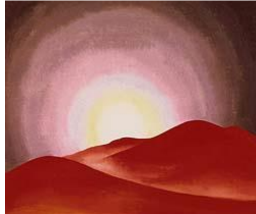
Red Hills, Lake George (1927), by Georgia O’Keeffe