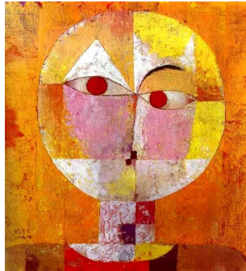
Senecio (1922) by Paul Klee

“One eye sees, the other feels.” --Paul Klee