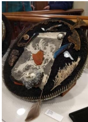
Sculpture by Kati Oates

showcasing some of the great variety of our members' interests and talents. The show continues through March 16.