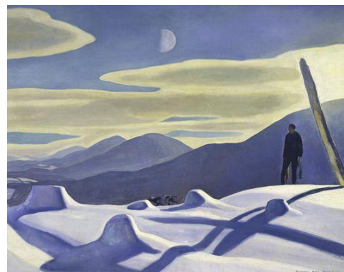
The Trapper (1921) by Rockwell Kent