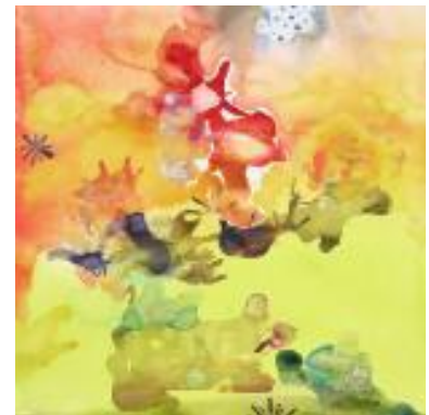
Eva Lundsager, Invitation 29; watercolor and sumi ink

DeCordova’s New England Biennial 2019 presents a survey of contemporary art showcasing our region’s