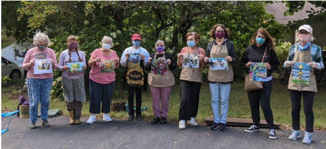
Happy batikers show their work