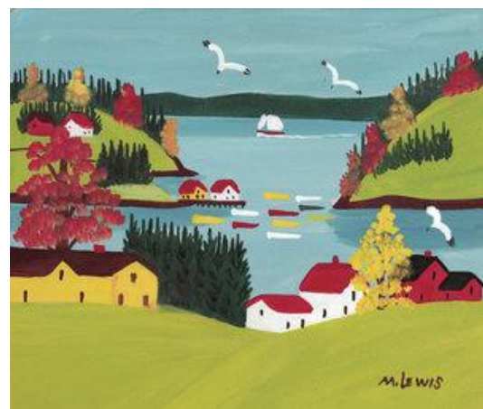
Painting by Maude Lewis