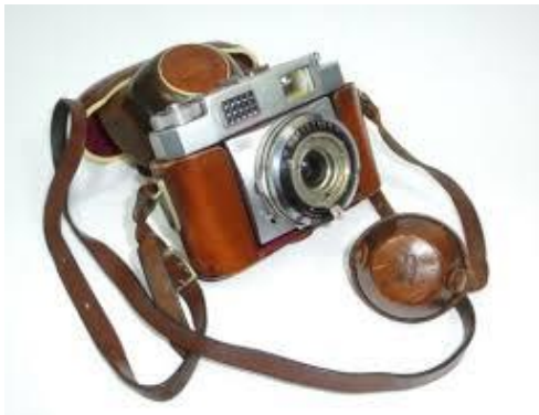
“The Stillness of Things—Photographs from the Lane Collection” at the Museum of Fine Arts through February 27, 2023

This exhibit showcases nearly 60 photographs—all departures from the traditional still life. The works on view span the entire history of photography. Museum of Fine Arts, 465 Huntington Ave., Boston, MA; https://www.mfa.org/exhibition/the-stillness-of-things