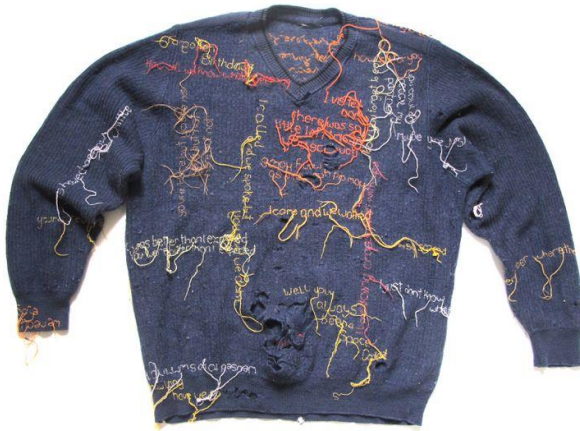
Lethe Jumper, wool, by Bridget Harvey from “The Conceptual Stitch”

Fabric art by 16 artists is featured in this exciting show. The diverse works illuminate current approaches to fiber in its many forms: from traditional fibers such as wool and thread and cloth to nontraditional fibers such as synthetics, paper, and plant materials. Concord Center for the Visual Arts, 37 Lexington Road, Concord, MA; https://concordart.org/current-exhibitions/