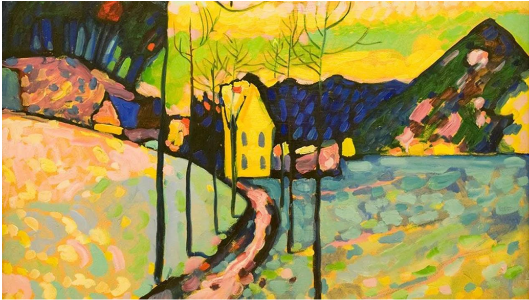
Wassily Kandinsky, Winter Landscape , 1909, oil on cardboard, Hermitage Museum

the composition. This imaginative work is a far cry from the New England winter landscapes with which we are all too familiar—unless we are perhaps factoring in climate change?