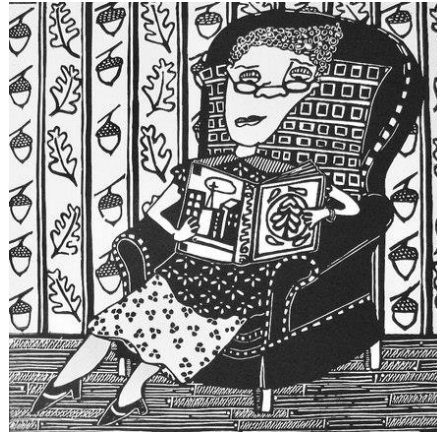
Dog Dog Dog and Blue Stockings; prints by Coco Berman from the Bedford Free Public Library show