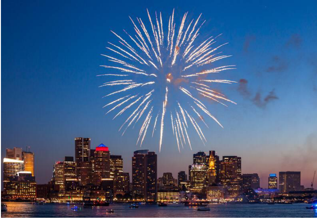
Fireworks over the Harbor

I can't think of a better visual with which to conclude this newsletter than this dramatic photo of our beautiful capital city on New Year's Eve. Doesn't it look like a painting? Happy New Year to all!