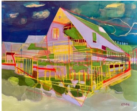
Art by Bonita LeFlore