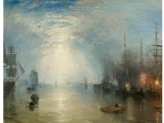
Keelmen Heaving Coals by Moonlight (1835) by J. M. W. Turner

One of Britain’s greatest artists, J. M. W. Turner (1775–1851) lived and worked at the peak of the industrial revolution, when steam replaced sail, machine power replaced human power, and wars, political unrest, and social reforms transformed society. “Turner’s Modern World” explores how this artist embraced these changes and developed an innovative painting style better to capture the new world. This landmark exhibition brings together more than 100 paintings, watercolors, drawings, and sketchbooks by Turner. These vivid and dramatic compositions demonstrate the artist’s commitment to depicting the era’s great events and developments, from technological advances to causes such as abolition and political reform. Museum of Fine Arts, 465 Huntington Ave., Boston; MA; https://www.mfa.org/exhibition/turners-modern-world