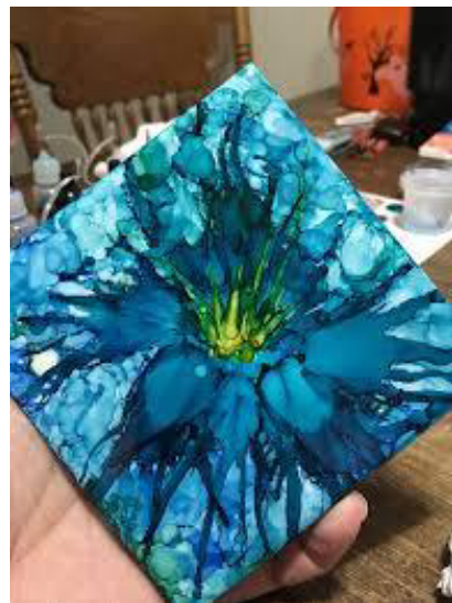
Coming soon: Alcohol Ink Tiles!