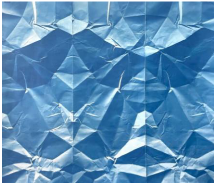
Cyanotype on paper by Shaina Gates from the New England Triennial 2022

The New England Triennial 2022 recognizes the vitality of contemporary art across the Northeast amid the recent years of upheaval and transformation. Spanning two museum venues—deCordova Sculpture Park and Museum and Fruitlands Museum—this year’s iteration features artwork by twenty-five artists from throughout New England.