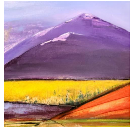
Mountain Air by Sylvia Mallory

A mixed media painting by Sylvia Mallory , Mountain Air , received third place recognition in the current "7 th Annual Landscapes" online show sponsored by Fusion Art. The show is up until June 4. You can view the exhibit at https://www.fusionartps.com/7th-annual-landscapes-art-exhibition-may-2022/