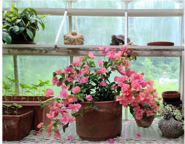
Growing Things , photograph by Sylvia Mallory ▶

Linda Cargiuolo and Taline Saatjian have artwork on exhibit in the current Grey Cube Gallery online show, "Forests and Meadows." Visit the following link to see the show: