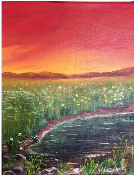
◀ High Meadow Pond , acrylic by Linda Cargiuolo

https://greycubegallery.com/current-show/index.html