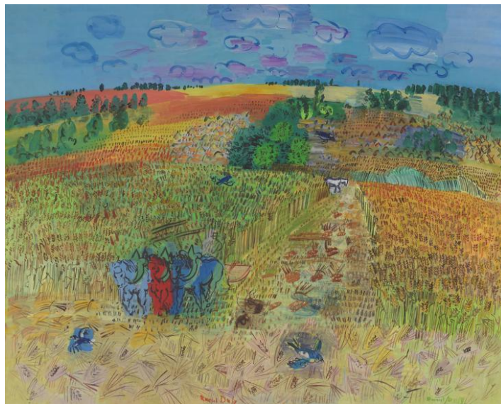
The Wheatfield (1929), oil on canvas, by Raoul Dufy (1877-1953)

In this harvest scene the fields are golden with wheat; the sky is intensely blue. Dufy's use of bright color and energetic brushstrokes recall Van Gogh's paintings. Happy Thanksgiving!