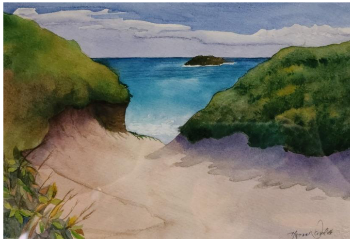
The Beach by Yvonne Sandell from Grace Chapel show