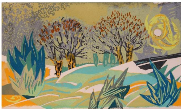
Winter Sun from the ALL printmaking show

This diverse printmaking show continues at the Arts League of Lowell (ALL) for the month of October. See the work of 11 area printmakers in a variety of styles and media. Gallery is open Wednesday to Sunday, from noon to 4 p.m. ALL, 307 Market Street, Lowell, MA; http://www.artsleagueoflowell.org/