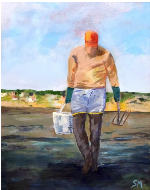
Shore Harvest by Sylvia Mallory from Grace Chapel show