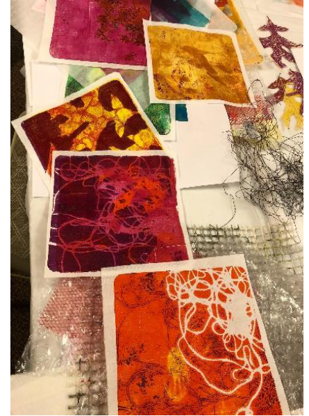
Students' Gelli Plate Prints

You can register at the Recreation Department's website, www.bedfordma.gov/recreation/pages/brochures , or by calling (781) 275-1392.