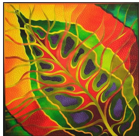
Quilt by Caryl Bryer Fallert-Gentry

After more than 40 years of experimentation, innovation, and excellence, artist Caryl Bryer Fallert-Gentry has earned her reputation as an icon. A prolific maker of fine art quilts (see example, right ), Caryl creates stunning works characterized by complex design, luminous colors, and illusions of light, depth, and motion. “Reflections of Light” features fifty of the artist’s extraordinary quilts. New England Quilt Museum, 18 Shattuck Street, Lowell; https://www.neqm.org/reflections-of-the-light-details