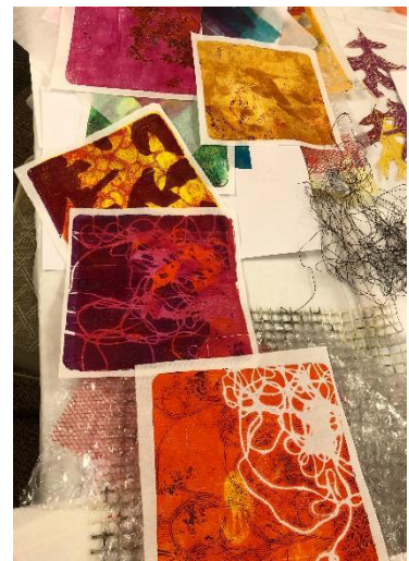
Students' gelli plate prints