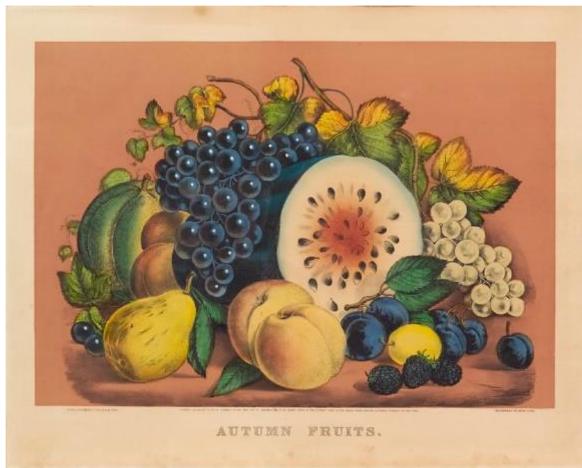
Autumn Fruits by Currier and Ives (1861); hand-colored lithograph.

This colorful still life lithograph by the printmaking firm of Currier and Ives celebrates the bounty of the American land. Enjoy the delights of the season!