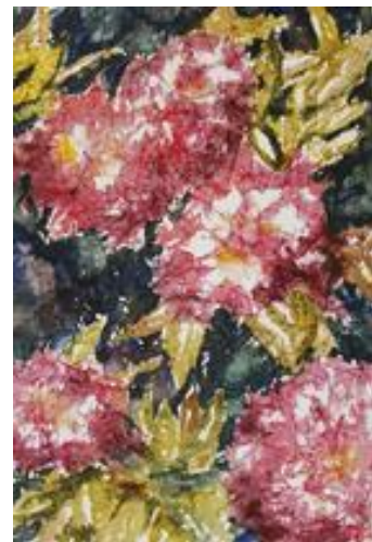
Full Bloom by Nan Rumpf

Bedford Recreation will run a workshop on “Crinkled Paper Technique for Watercolorists.” In this virtual (Zoom) program, join Nan Rumpf in exploring the use of watercolors on a special Asian paper with sizing. Nan will demonstrate the steps for preparing the paper and the best way to use your brushes to obtain the crinkled paper look. This technique is excellent for painting rocks, trees, shrubs, flowers, landscapes, and more.