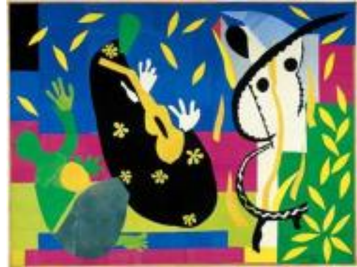
Henri Matisse, The Sorrows of the King , collage, 1952

through June 27. Unique 2D or 3D collage or assemblage is eligible. Artists may use photographs and/or “found” photographic images; however, all media are welcome. Work may be entirely pasted paper pieces or even totally photographic images, as long as the individual parts result in a unique “whole.”