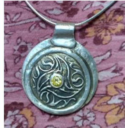
Students' work from the precious metal clay workshop