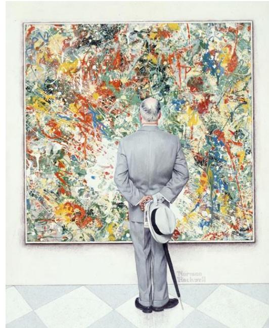
The Connoisseur by Norman Rockwell

This year's event will be an unjuried show and sale. There will be no judging and no prizes—just a wonderful chance to display and sell your work. BACS members may submit up to three pieces of artwork or craftwork in a variety of categories at no charge; nonmembers will pay a small entry fee. The exhibit categories are (1) watercolor painting; (2) oil/acrylic painting; (3) drawing and pastel painting; (4) three-dimensional; (5) photography; (6) other media (collage, batik, mixed media, printmaking).