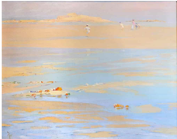
Figures on the Sand (Annisquam), by Elizabeth Wentworth Roberts

All Concord Art members are welcome to submit an image to the annual calendar contest for jurying; no fees are required. This year's theme is "Figure/s in the Landscape." The submission deadline is September 30. For more info visit https://concordart.org/ .