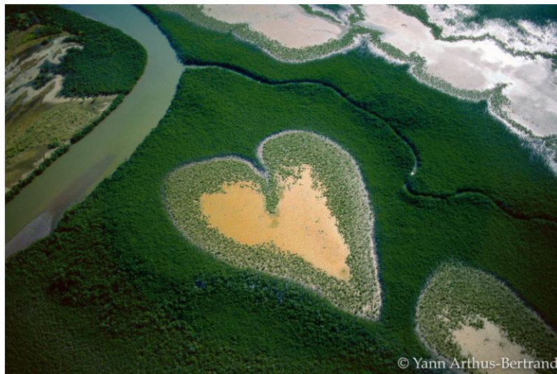
Heart Formation in Voh, New Caledonia (French Overseas Territory)

Yann Arthus-Bertrand (1946 – ) is arguably the best-known aerial photographer in the world. He has sold more than 3 million copies worldwide of his pathbreaking photo essay Earth from Above , a decade-spanning attempt to photograph all the vistas of the planet from the sky, whether by helicopter, hot air balloon, or anything else that flies.