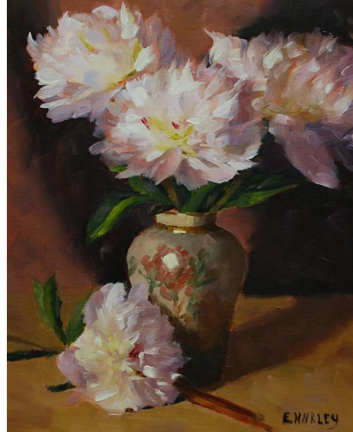
Painting by Ellen Hurley

Two paintings by Ellen Hurley have been juried into the Lyme Art Association's annual "Deck the Walls" art exhibit. You can take a fabulous virtual tour of the show at https://lymeartassociation.org/exhibitions/current-exhibition/