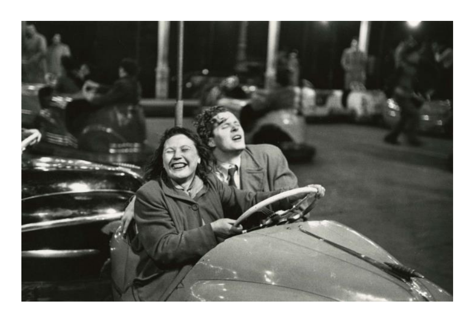
Couple/Paris, 1952 (detail), by Robert Frank

"There is one thing the photograph must contain: the humanity of the moment." --Robert Frank