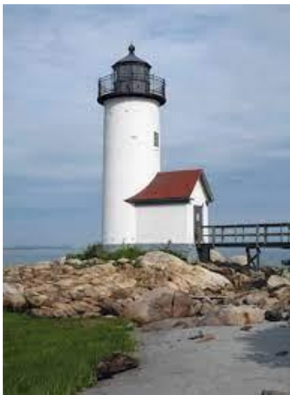
Annisquam Lighthouse, Gloucester