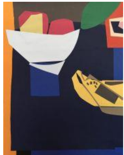
Collage by Nancy Gruskin

Please watch for updates in subsequent newsletters.