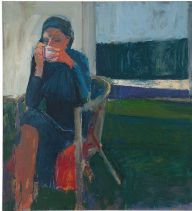
Coffee, 1959, by Richard Diebenkorn (1922–1993). Oil on canvas, San Francisco Museum of Art.

We can all relate to the subject matter of this painting, right? The artist, Richard Diebenkorn, is known for his abstract landscapes, though here a java-sipping human figure is the focal point. Whatever the content, Diebenkorn is celebrated for capturing the essence of his subjects without representing them literally.