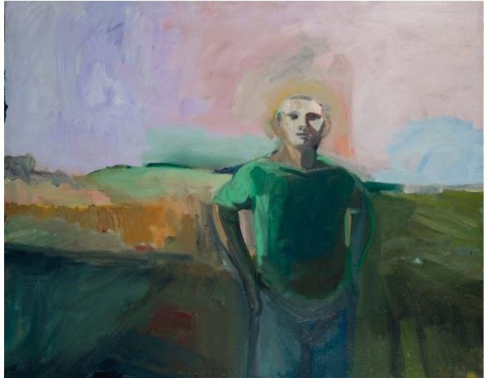
Man and Lavender Sky by Elmer Bischoff, 1957-1958

All Concord Art members are welcome to submit an image to the annual calendar contest for jurying; no fees are required. This year's theme is "Figure/s in the Landscape." The submission deadline is September 30. For more info visit https://concordart.org/ .